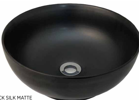
BLACK SILK MATTE